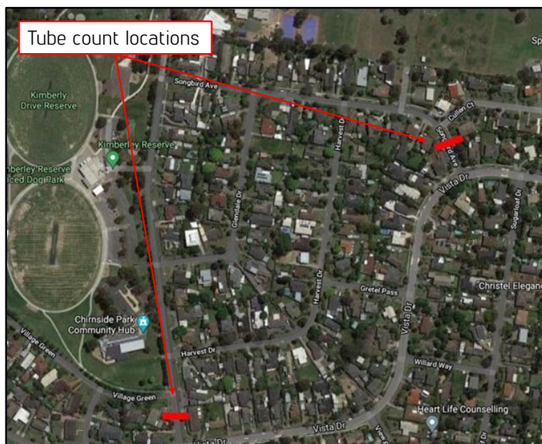
Figure 2 Tube count locations

The results are summarised in Table 3 with detailed data provided in Appendix 1 . It is noted that the data collected on Friday 6 th August has been omitted to discount any effect from the Victorian COVID-19 lockdown.